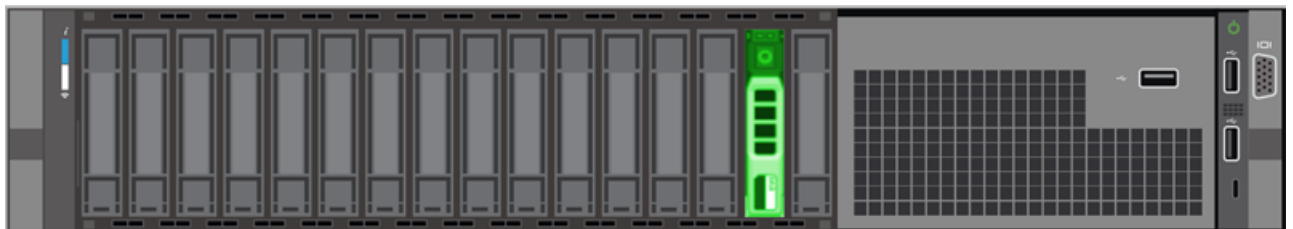
Figure 3: EDA 9200 and EDA 10200 - Slot 14