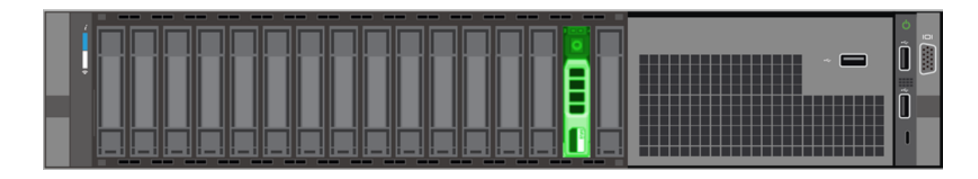
Figure 3: EDA 9200 and EDA 10200 - Slot 14