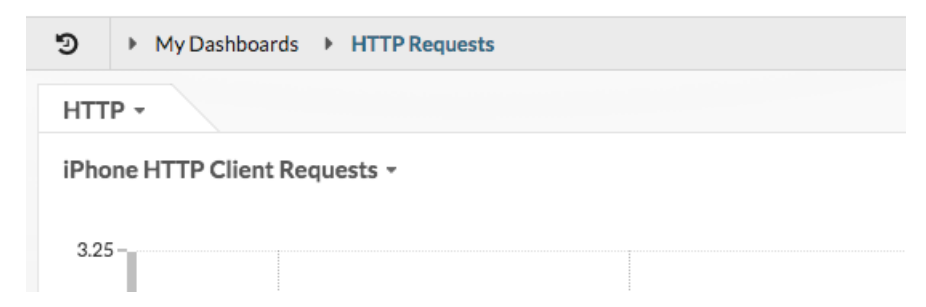
Figure 2: After