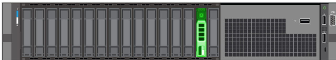
Figure 3: EDA 9200 and EDA 10200 - Slot 14