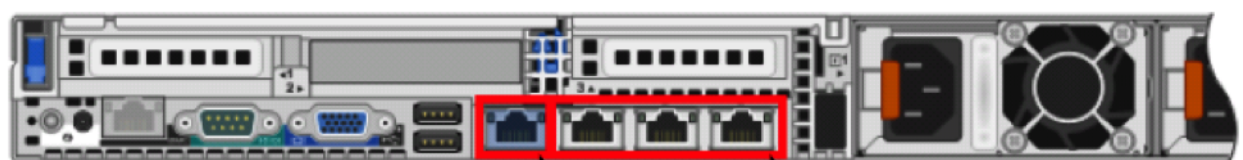
Management Port 1GbE Capture Ports