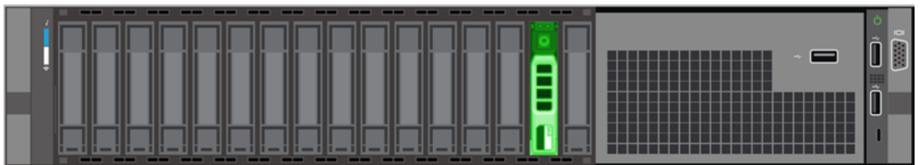
Figure 3: EDA 9200 and EDA 10200 - Slot 14