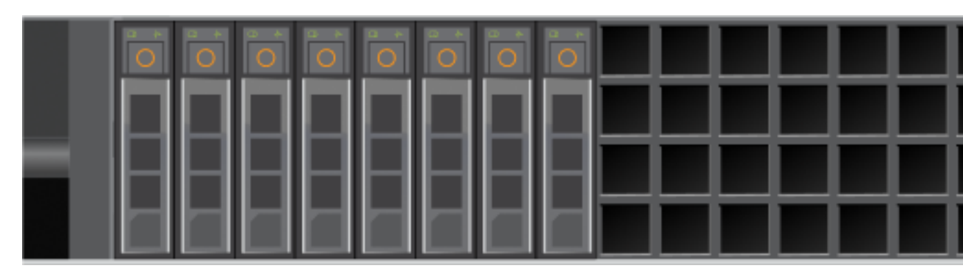
Figure 6: EDA 10300 - Slot 12