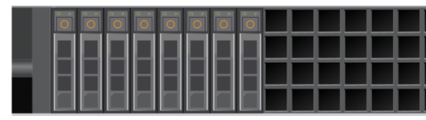
Figure 4: EDA 9300 - Slot 10