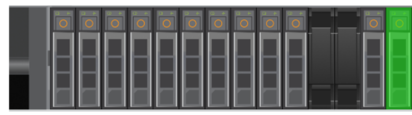
Figure 5: EDA 10200 - Slot 14